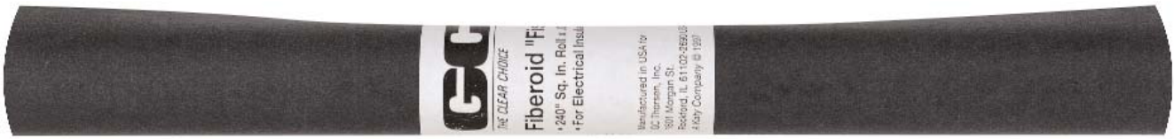
Fig. 1 Note: 0.01" ±10% Thickness