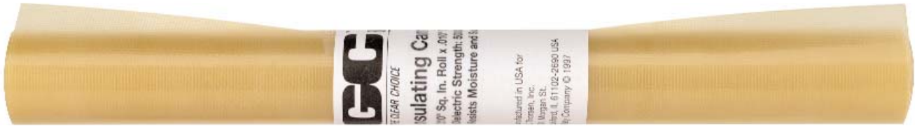
Fig. 2 Note: 210 sq. in. (9 in. wide) • Dielectric Strength 5,000 V